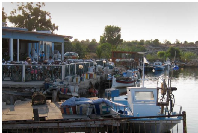
Potamos Fish Restaurant

This is within a couple of hundred metres of the villa but unfortunately the other side of the creek so a two minute drive.