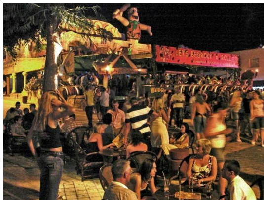
Bedrock karaoke bar

On the right as you enter the town is Luna Park a large fairground dominated by the Slingshot ride which you can see lit up at night from across the bay.