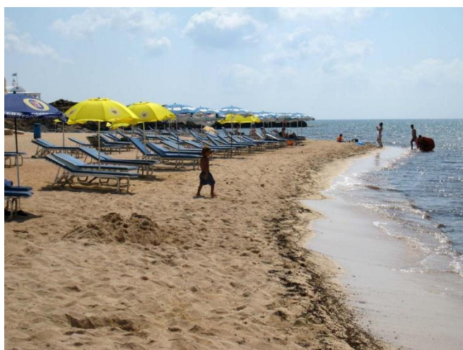
Agia Thekla Beach

If you take the main road towards Agia Napa, after two minutes you come to Agia Thekla beach and church which you will see on the right.